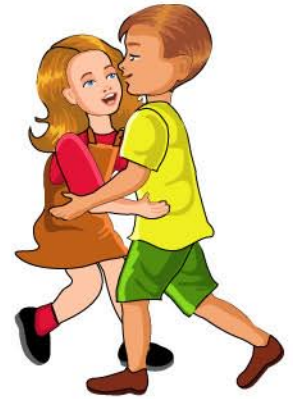
girl - boy