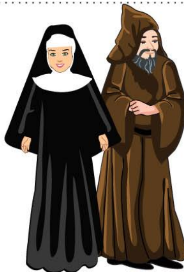
nun - monk