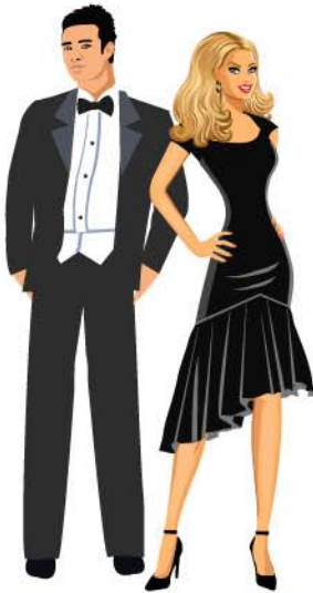
man - woman