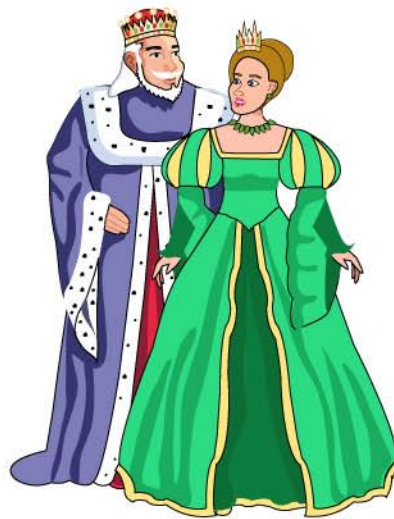
king - queen