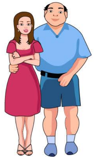
wife - husband