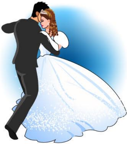
bride - bridegroom