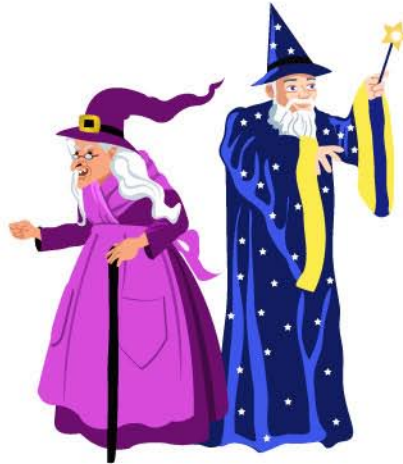
witch - wizard