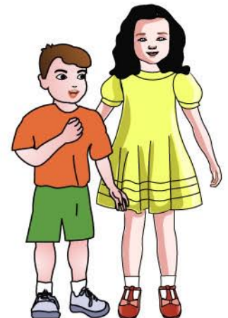
brother - sister